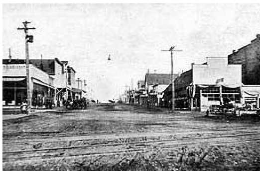
Main Street, Newport, 1900s